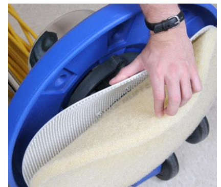
Flexible pad driver with full face pad grip contours to uneven floors.