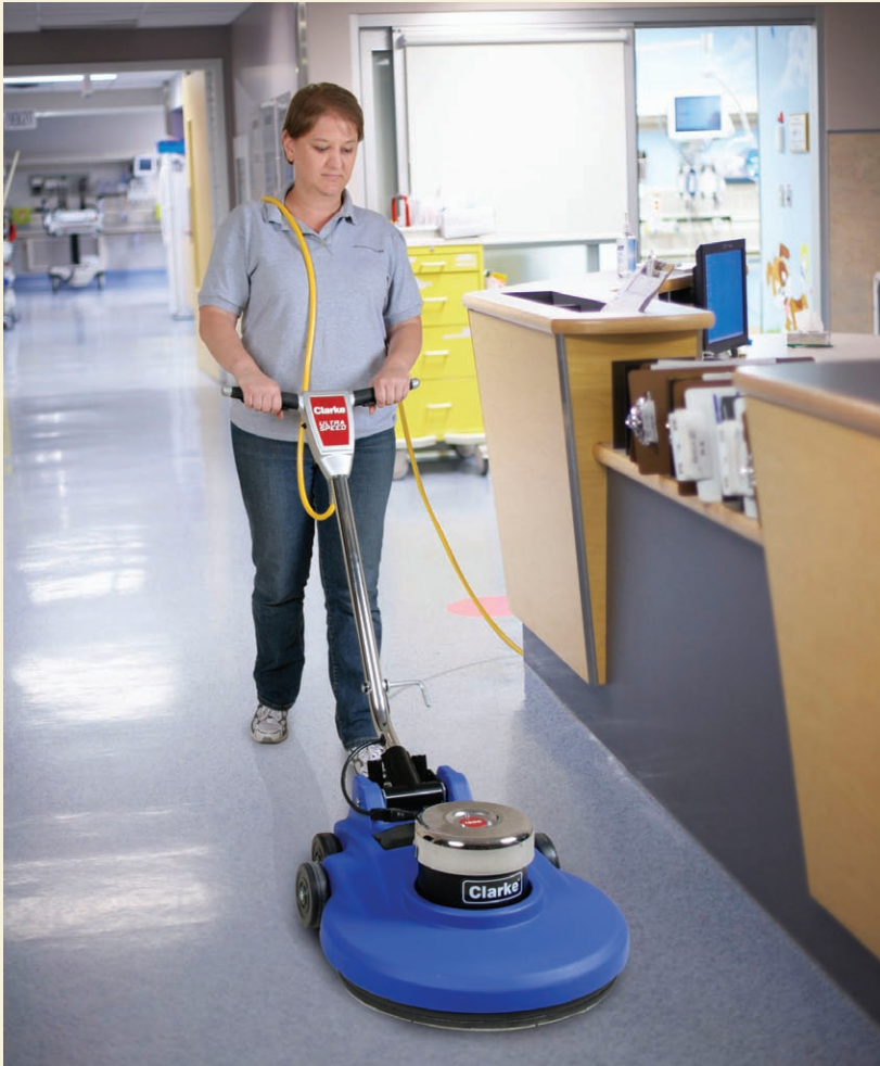
The Ultra Speed is ultra quiet for noise sensitive areas. Dust control model shown.

The Clarke Ultra Speed line of corded burnishers have the latest in innovative features that provide the highest shine with minimum effort. The self adjusting pad pressure assures optimal power is applied to the pad driver without the need to change any settings or make adjustments. The Ultra Speed is lightweight, easy to maneuver, and is very quiet when working in noise sensitive areas. The powerful motor of the Ultra Speed supplies the highest power permitted from a wall outlet.