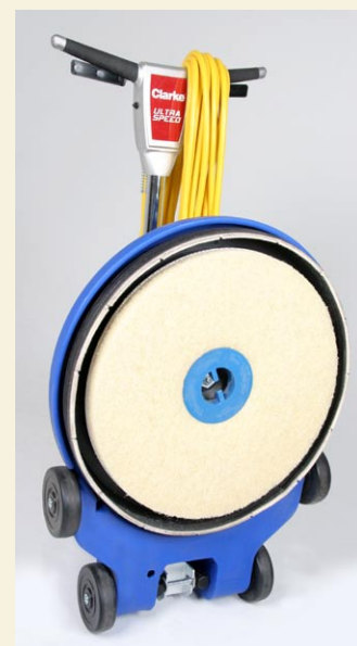
The upright storage position allows for easy pad change .