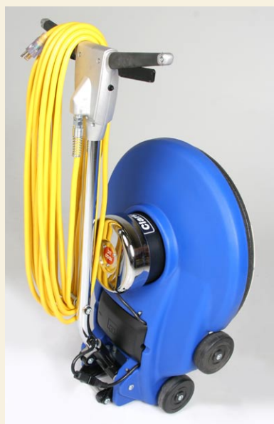
The fold down handle permits the burnisher to fit into compact storage spaces.