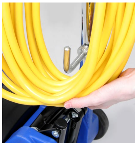
A quick release cord wrap assists the removal of the power cable without unwrapping.