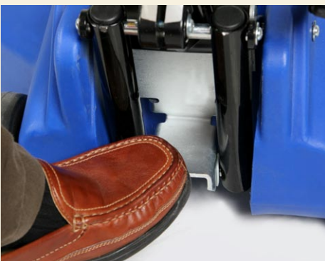
Easy to operate pedal releases the control handle to the operate or storage position.