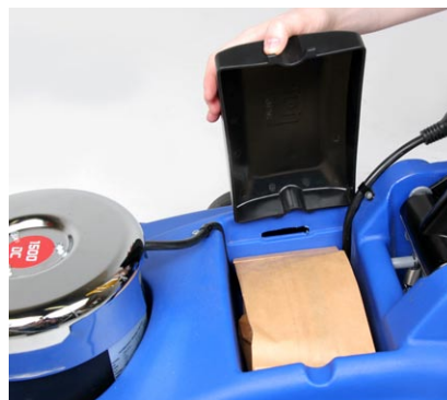
Passive dust control eliminates airborne dust and collects it in a convenient filter bag.